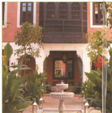
Les Borjs de la Kasbah Marrakech, Morocco +212 24 38 11 01 www.lesborjsdelakasbah.com