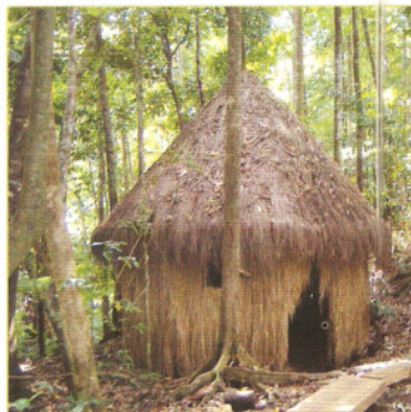
3 Rivers Eco Lodge Newfoundland Estate, St David, Dominica 1 767 446 1886 www.3riversdominica.com